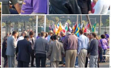
Worship through Art